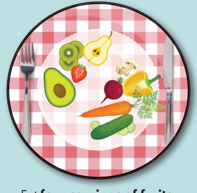
Eat four servings of fruits and five servings of vegetables each day.

HOW WILL YOU ANSWER? BEING ACTIVE AND MAKING SMART FOOD CHOICES CAN HELP YOU KEEP YOUR WEIGHT IN CHECK AND IMPROVE YOUR HEALTH.