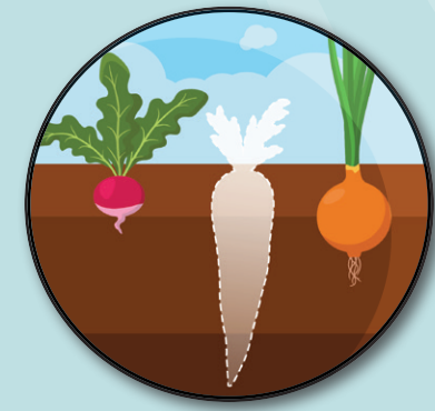
Fewer than 1 in 10 children and adults eat the recommended daily amount of vegetables.