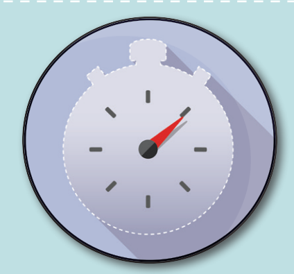
Get at least 150 minutes of moderate-intensity exercise each week.